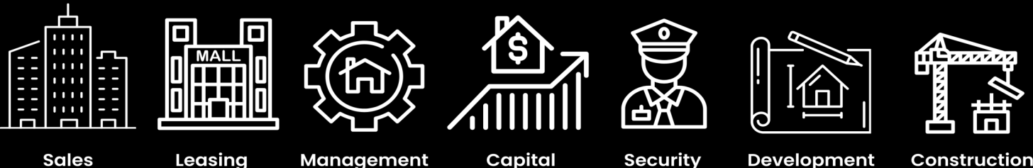
Sales Leasing Management Capital Security Development Construction