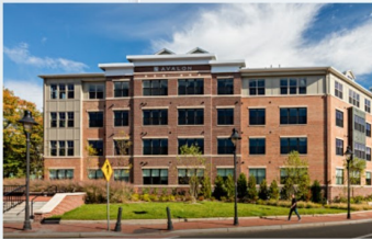
238 Units-NJ Approvals- Sold to Institution