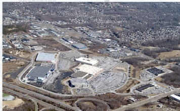
1M SF InvestCorp JV Ocean Twp NJ