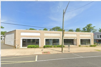
13,600 SF Brides Trust Building Short Hills, NJ