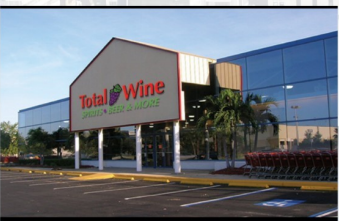
Total Wine JV Tampa, FL