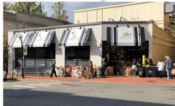
12,000 SF Kings Mkt from WP Carey Leased and Sold