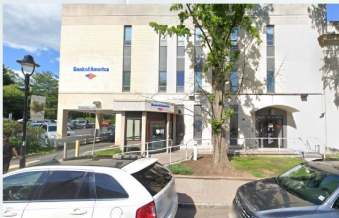
12,000 SF Office - NJ Acquired from Gramercy Trust