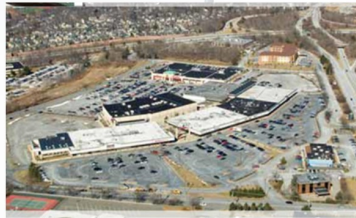
350,000 SF -NJ Redevelopment JV- RREEF