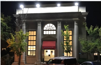
NNN Bank Of America Maplewood, NJ